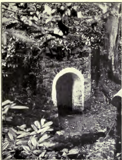
THE DEAN'S WELL AT GOSFORD CASTLE